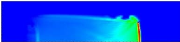
Fig 1 Pressure contours for explosive shock wave.

We present two fluid-structure interaction problems in shock wave propagation. The first is a verification trend test for a 2-D explosion in a flyer-plate impact experiment [Fig. 1]. The second problem involves blast loading in geotechnical centrifuge experiments, which is purported to be predictive of full-scale response via established scaling laws. The specimen (a contain of soil) is spun on the centrifuge to increase the g-forces in the model to produce identical stresses in both the centrifuge surrogate and the full-scale problem. We will show a quantification of importance of Coriolis body forces in the simulations along with preliminary assessments of the validity of scaling laws using more realistic (irreversible large-deformation) constitutive models than were the basis of the original the scaling laws.